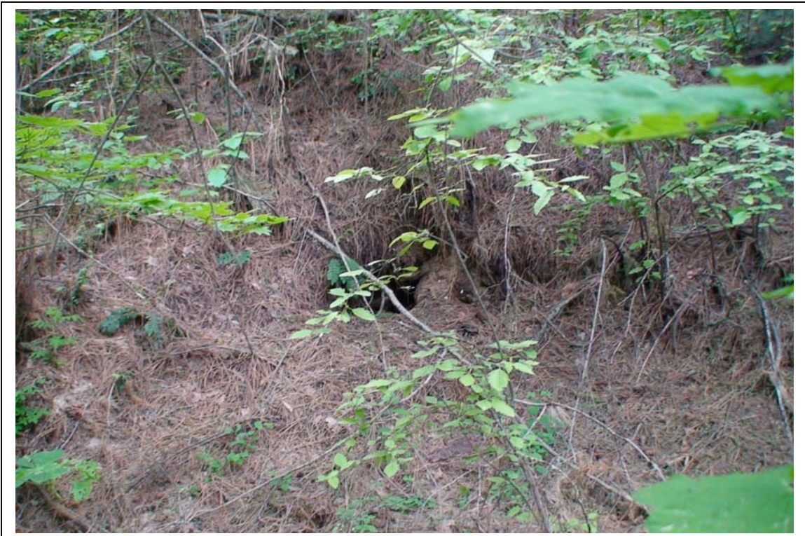
4-2 Adit to Mine #3 1st level West