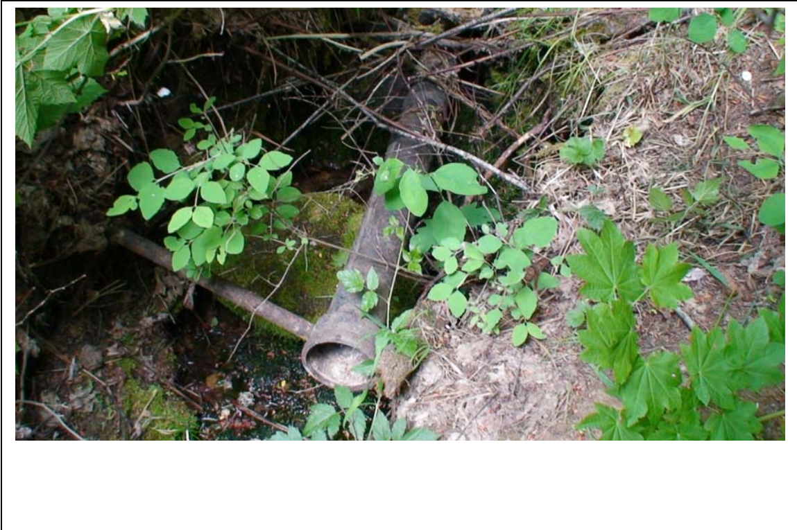
4-4 Adit to Mine #6 1st level East