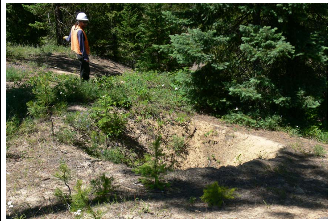
Sinkhole near B11 top of Section 26