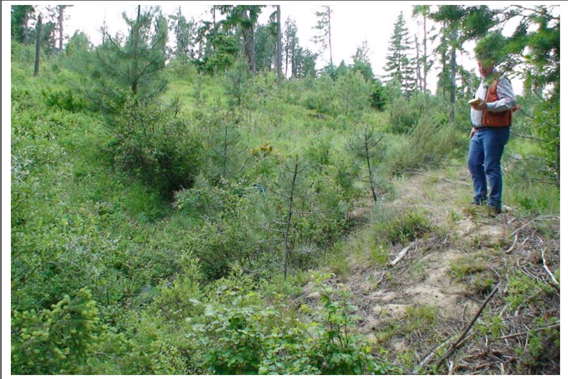
Sinkhole at the top of Section 26