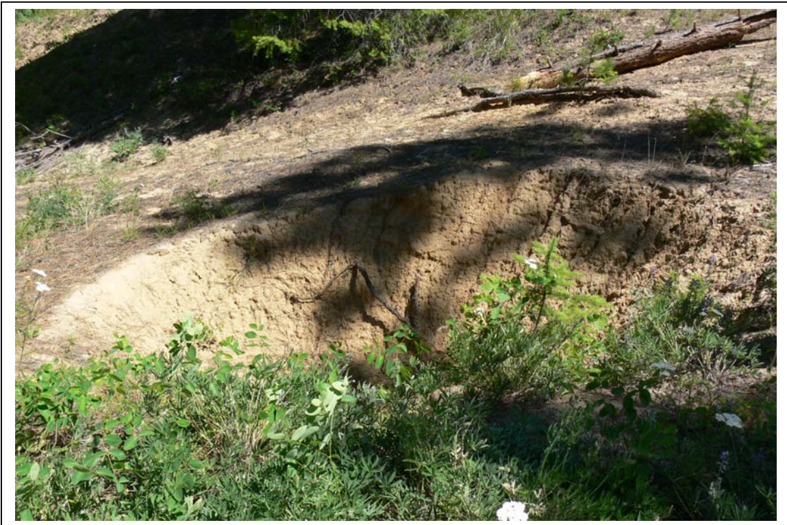
Sinkhole near B11 top of Section 26