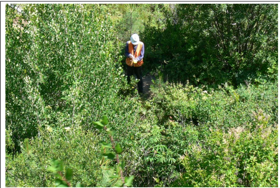
5-1 Air Shaft near creek in Section 25