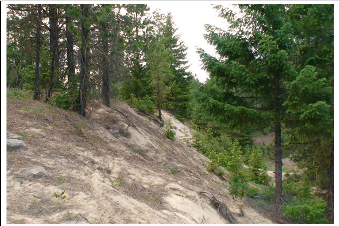
Open Pits top of Section 26