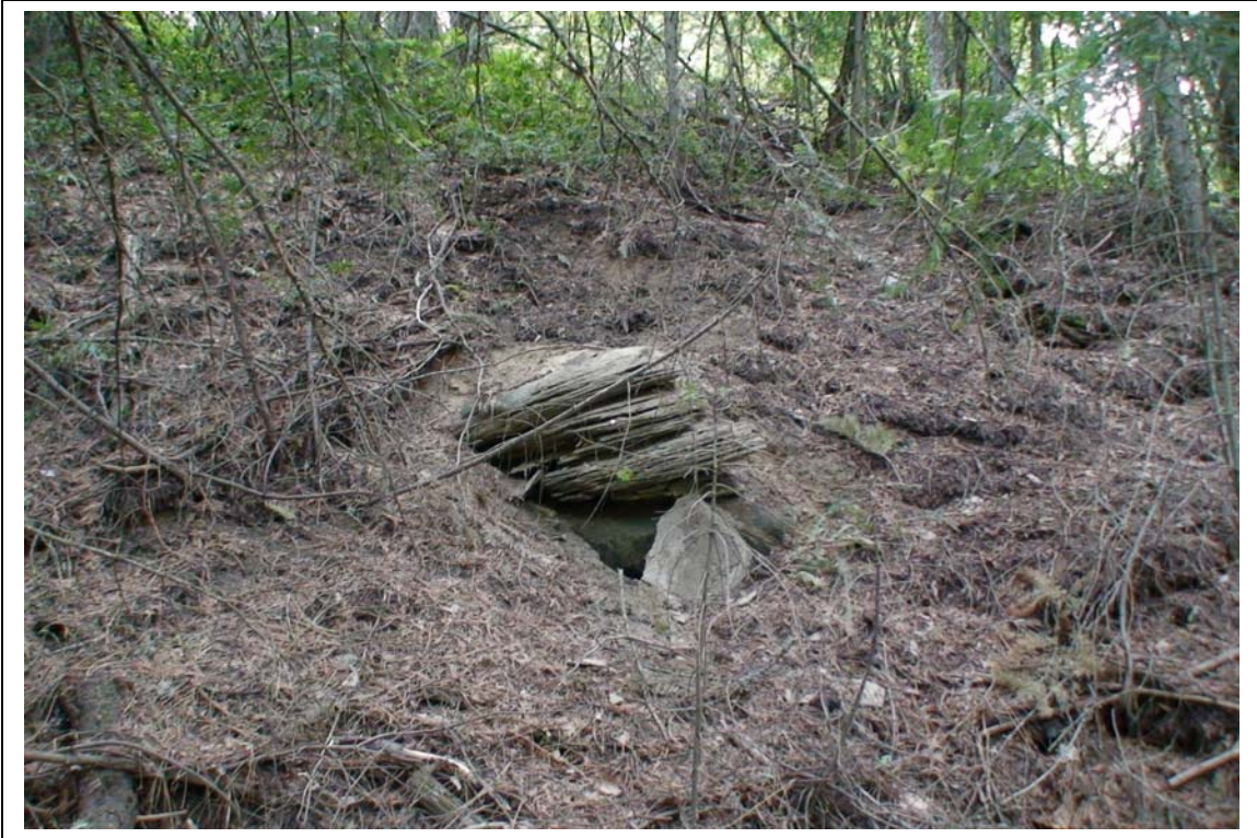
4-1 Collapsed Adit on West Side of Deer Creek