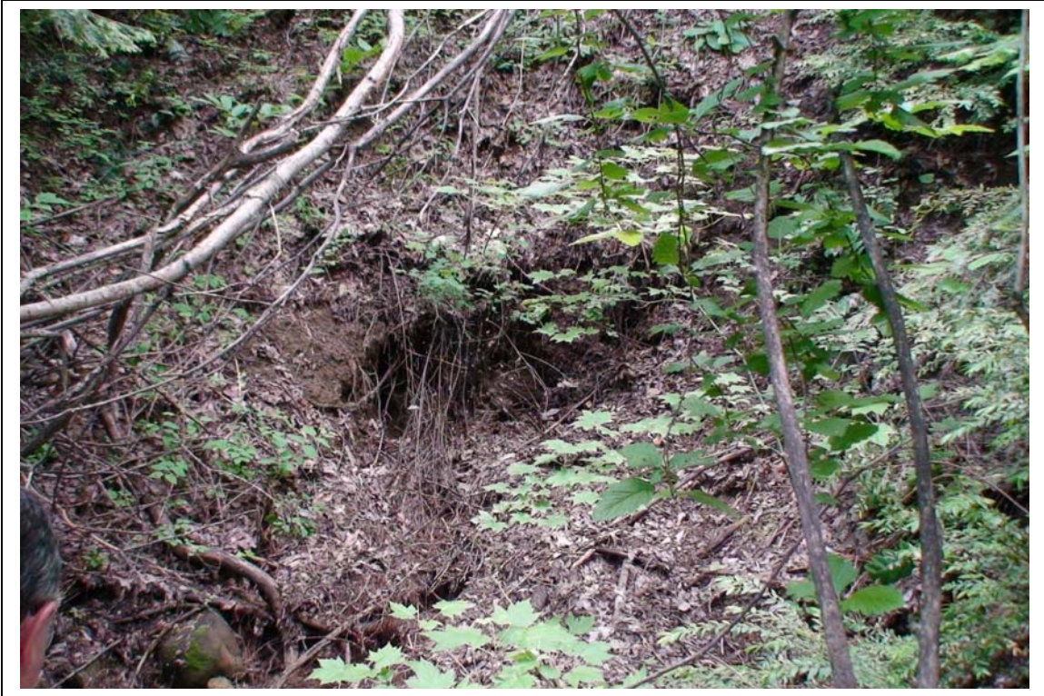
4-2 Adit to Mine #3 1st level West