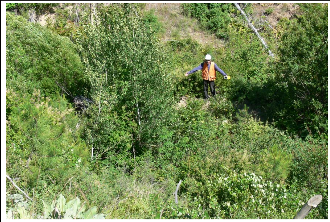
5-1 Air Shaft near creek in Section 25