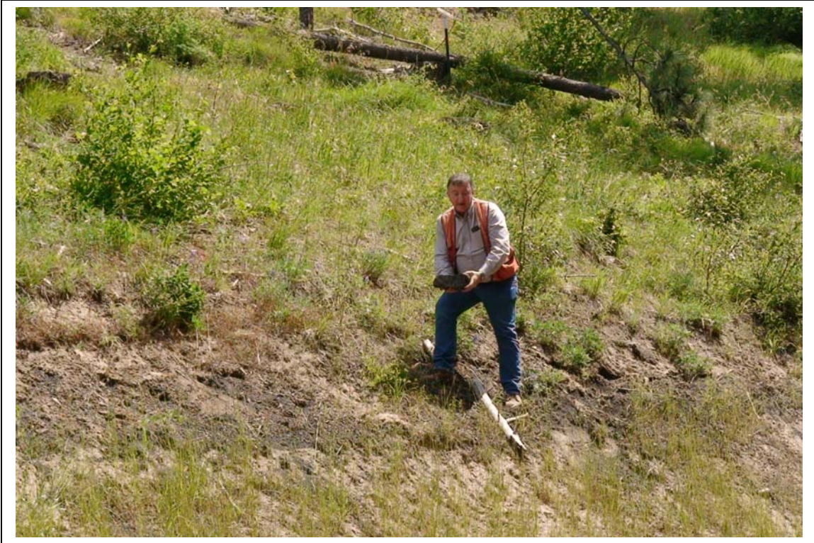
4-6 Outcrop Mine #3 between 1st and 2nd levels