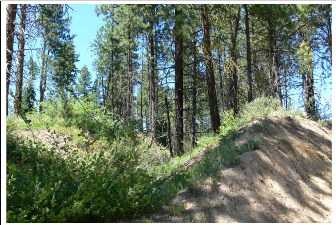
3-1 Collapsed Rail Tunnel North alignment