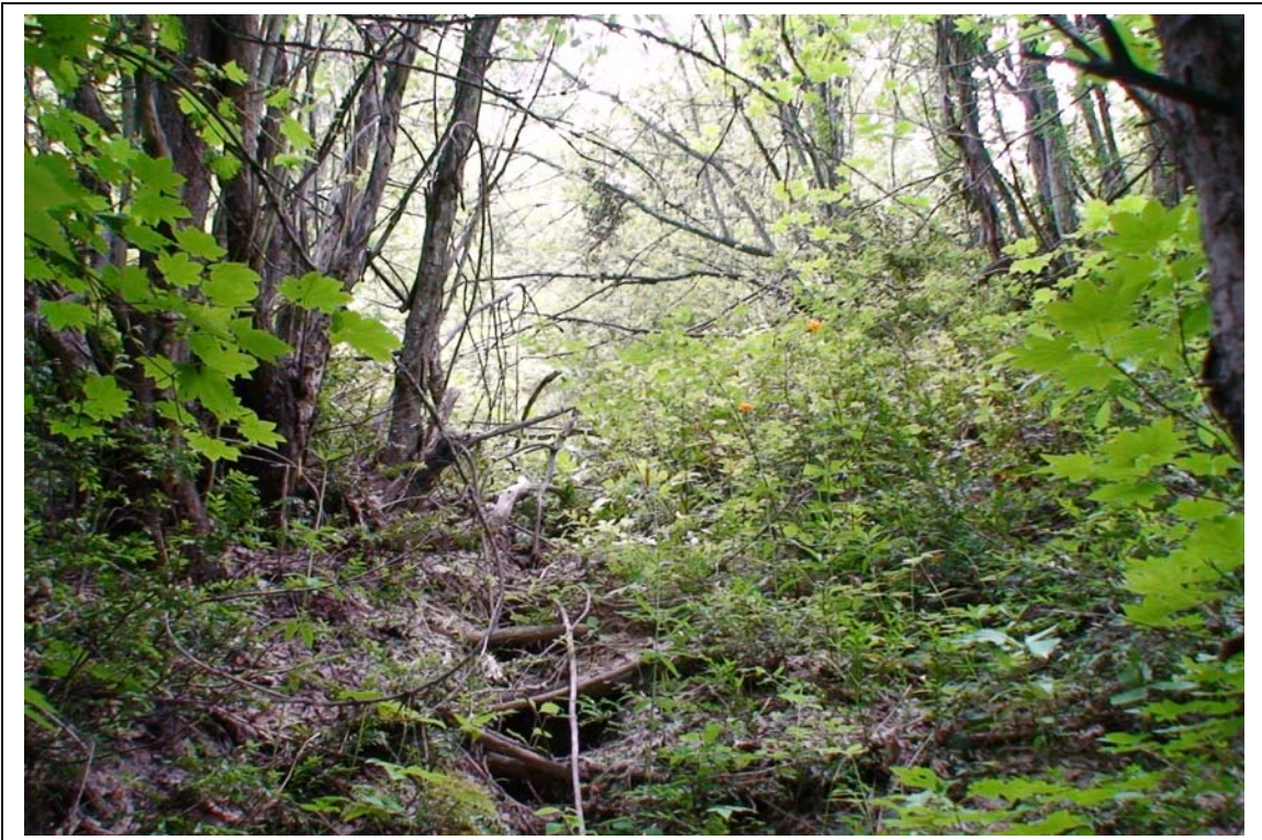
4-3 Collapsed Adit to Mine #3 1st level West