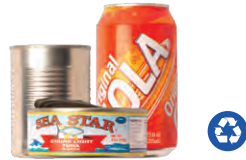
Food & Beverage Cans No loose lids