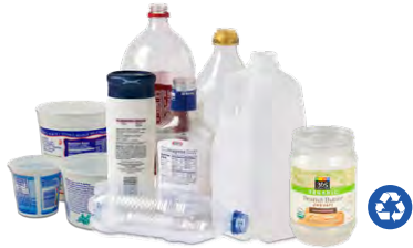
Plastic Bottles, Jugs, Jars & Dairy Tubs No lids

All items must be clean, empty and placed loose in the recycle cart. Recycle only these items.