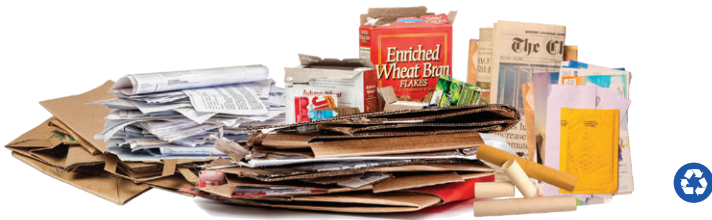
Paper, Flattened Cardboard & Paperboard