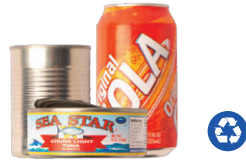
Food & Beverage Cans No loose lids