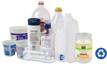
Plastic Bottles, Jugs, Jars & Dairy Tub No lids

All items must be clean, empty and placed loose in the recycle cart. Recycle only these items.